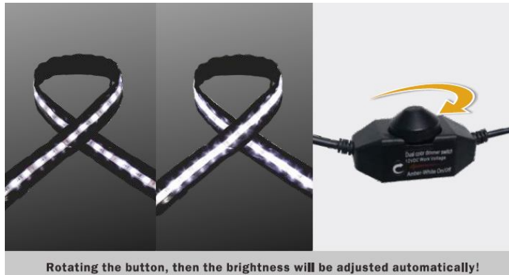
Rotating the button, then the brightness will be adjusted automatically!